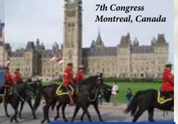
7th Congress Montreal, Canada