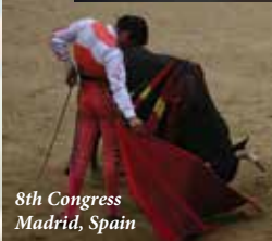
8th Congress Madrid, Spain