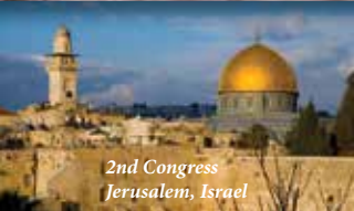
2nd Congress Jerusalem, Israel