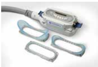
Figure 3: The CoolAdvantage applicator features a cooled treatment cup and interchangeable contours for flat and curved treatment sites.

With the interchangeable contours, as shown in Figure 3, one applicator can treat a variety of body areas. With the CoolFit Advantage flat contour, we can treat the inner thighs and arms. The CoolCurve+ Advantage contour addresses sharply curved areas such as the flanks. And the CoolCore Advantage contour is suited for the abdomen.