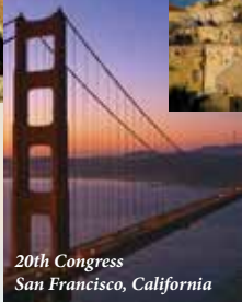
20th Congress San Francisco, California