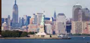
9th & 13th Congresses New York City