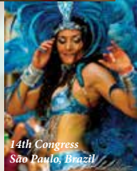
14th Congress São Paulo, Brazil