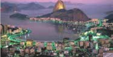
1st, 5th, 18th & 22nd Congresses Rio de Janeiro, Brazil