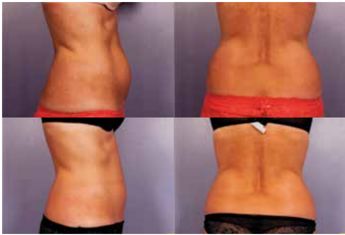
Figure 2: This 55 year old female was pleased with her noticeable fat reduction and new body contours. She received two CoolSculpting treatments to her flanks and lower abdomen. Procedure by Dr. W. Grant Stevens at Marina Plastic Surgery.

The latest development from CoolSculpting is the CoolAdvantage applicator, a contoured cup applicator that offers greater comfort and shorter treatment times. Following the successful introduction of the CoolMini applicator, the small cup applicator evolved to a larger cup for treating areas such as abdomens and flanks. The CoolAdvantage cup geometry maximizes tissue contact with the cooling surface, which increases treatment efficiency. The lower temperature protocol and applicator geometry reduce treatment time from 60 to 35 minutes. The targeted tissue seats fully against the cooled cup and the reduced skin tension results in greater patient comfort during treatment.