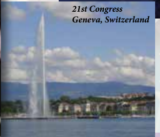
21st Congress Geneva, Switzerland