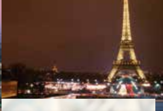
3rd & 12th Congresses Paris, France