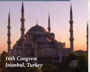
16th Congress Istanbul, Turkey