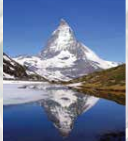
21st Congress Geneva, Switzerland