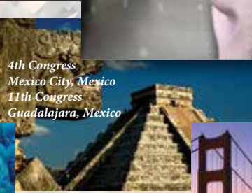
4th Congress Mexico City, Mexico 11th Congress Guadalajara, Mexico